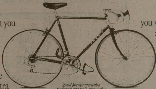
Spend five minutes with a Macintosh and walk away with a free bicycle cap. You may even win a Trek® 12-speed touring bike.