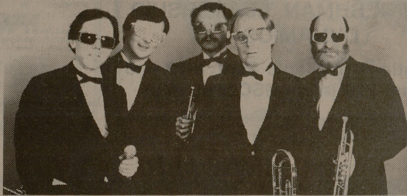
The Canadian Brass

The MSC Opera and Performing Arts Society still has a few good seats available for the 1986-87 season. For a limited time, save up to 25% over single ticket prices. Single tickets will not be available for every performance. The great performances always sell out.