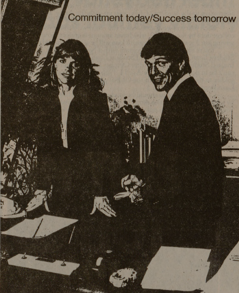
Commitment today/Success tomorrow

delta sigma pi the professional business fraternity Fall Rush '86 September 11-20 Visit Tables in Blocker Lobby