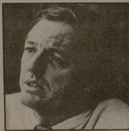
William F. Buckley Jr.

The Contra debate is coming up again now, and it's time to review some of the rhetoric that has been used. As an example of militancy, opponents of Contra aid like to cite Patrick Buchanan. Now, Buchanan is one of the loudest polemicists in town, and sometimes one gets the impression that he thinks nuance is just a little effete. Here is what he wrote about the Sandinistas in March: "About the character of the Sandinista regime, doubt no longer remains. Even the 'useful idiots' of Lenin's depiction — the liberated nuns and Marxist Maryknollers, the journalistic camp followers and tenured professors anxious to woe the coeds with how they picked coffee beans for the revolution — seem defensive." I wish I had said that.