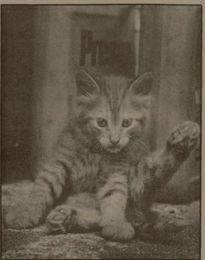
Stupid pet tricks ..... p.11