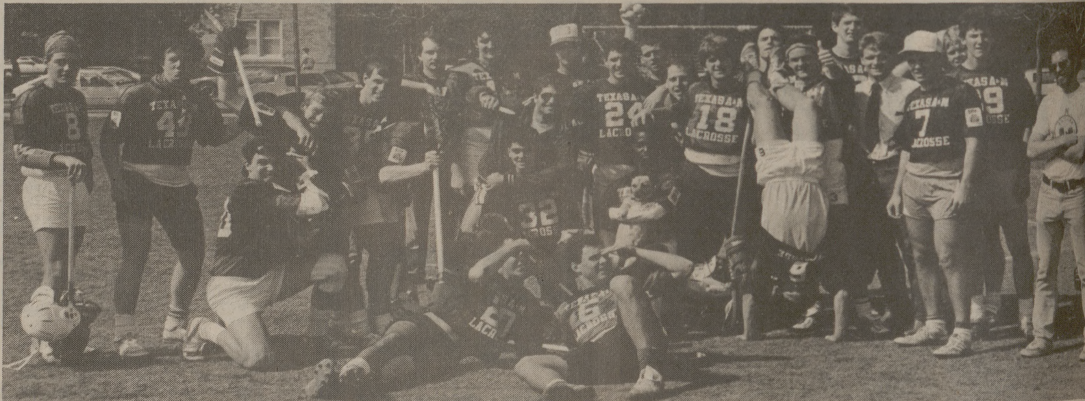
the 1985-86 Sports Club of the year — The Lacrosse Club.

Every year the Intramural Dept. selects a sports club as the outstanding sports club of that school year. The selection is based upon several factors, including club administration, representation of the university, and community involvement. The Texas A&M Intramural Dept. would like to congratulate this year's sports club of the year — The Lacrosse Club.