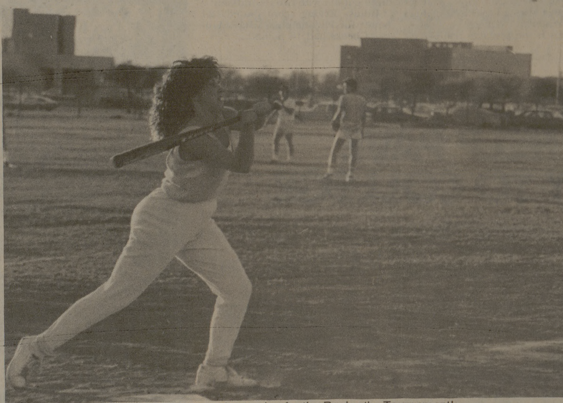
Tomorrow's the last day to sign for the Penberthy Tournament!

-Softball Playoffs will be posted on or after Tuesday, April 8 pending rain. -Rainout number for Softball is 845-2625.