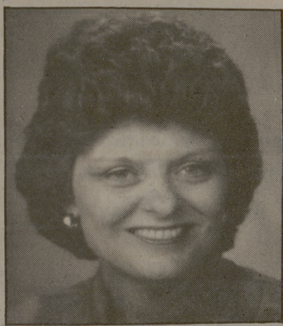
Texas' Jody Conradt