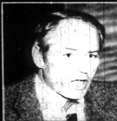
Dr. Stephen Ambrose U.S. Foreign Relations Specialist, Author, Host of CBS' "The Day After"