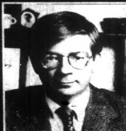
George Will , Moderator Pulitzer Prize Winning Columnist

James Earl Rudder Auditorium, Texas A&M University