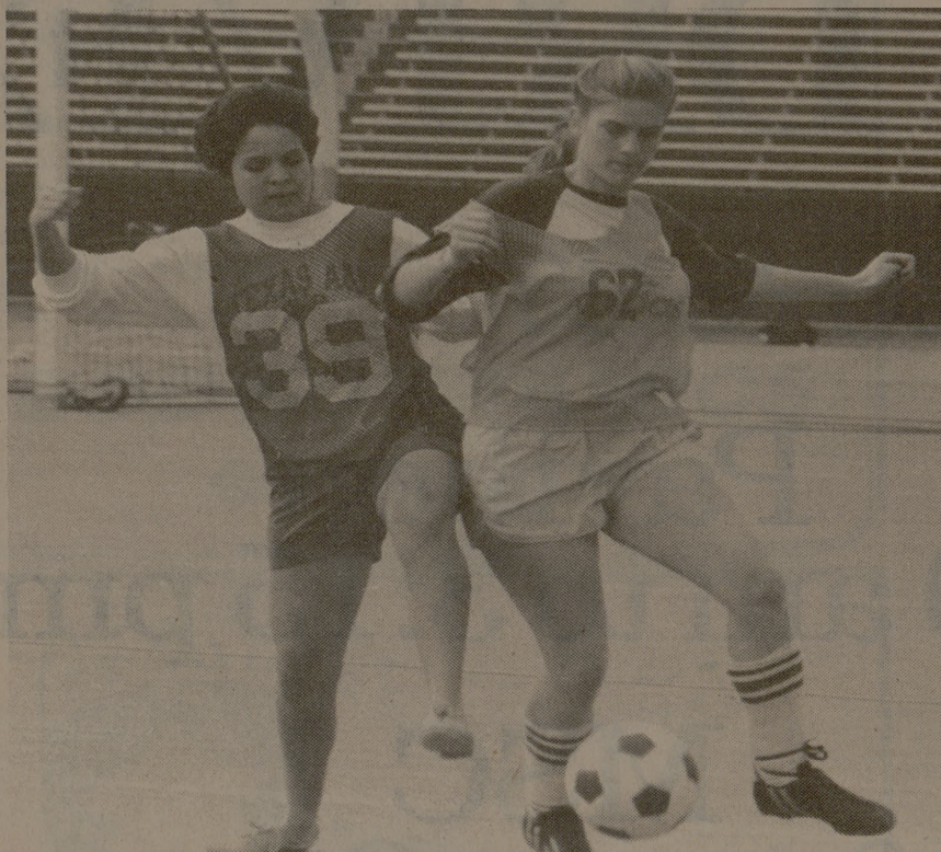
A member of McFad Flirts controls the ball against a member of Class B All U Champs Kruegerands.