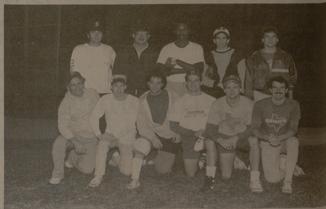
C.C. Creations, the Men's A Champion of the Preseason Tournament.

Table Tennis Doubles- Table Tennis anyone? Or Ping Pong anyone? Entries open Monday, Feb. 24 and close Tuesday, March 4. Play begins Tuesday, March 11 in 304 Read Bldg. USSTA Rules will apply. Matches consist of best two out of three games to 21 points. There is no entry fee.