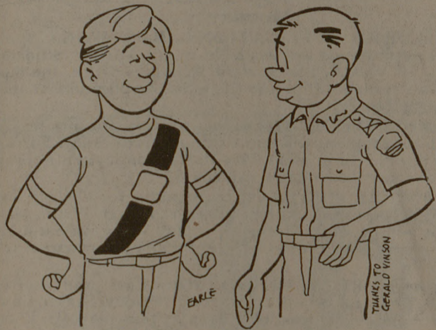
"When I'm driving, it looks like I'm wearing a seatbeat."