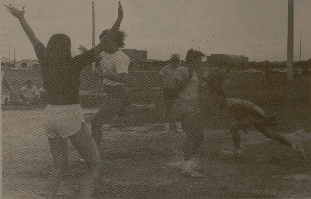
Gear up for Softball! Entries close THIS WEEK!

INTRAMURAL-RECREATIONAL SPORTS OFFICE.....845-7826 READ BUILDING CHECKOUT.....845-2624 RAINOUT AND INFORMATION NUMBER.....845-2625