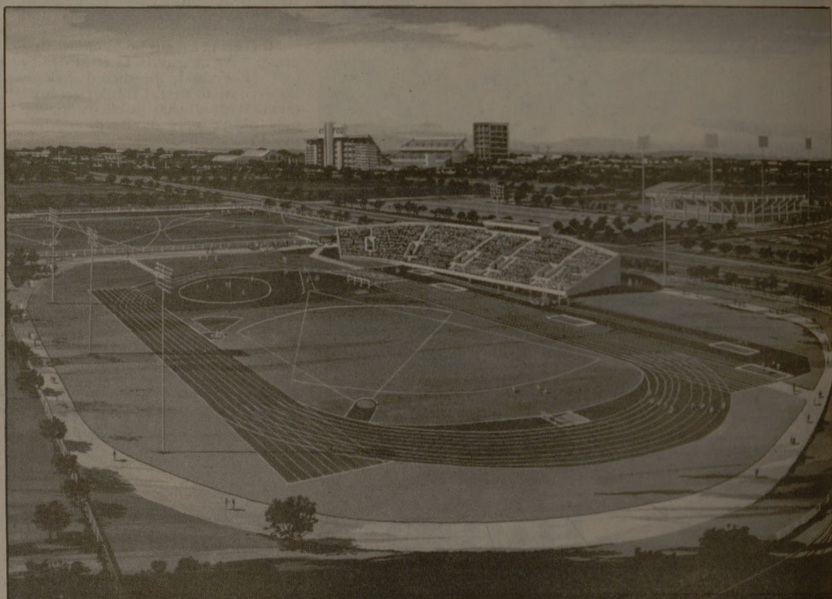
Phase I of the Frank G. Anderson Track and Field Complex (above) is scheduled to be completed March 8 in time for the A&M track teams to host their first meet in over three years.

If and when Phase II is completed, the facility will have cost