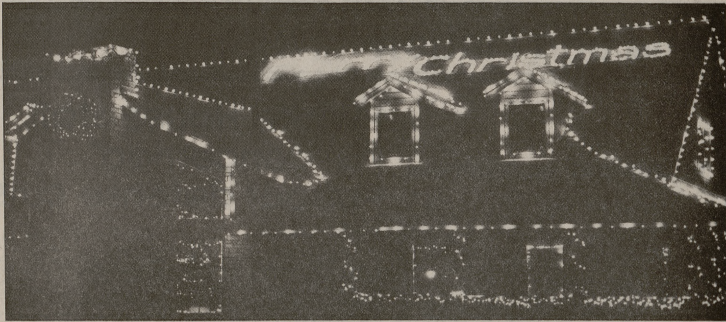
College Station's Central Park and its buildings received the golden glow of Christmas Monday evening during the lighting cere-