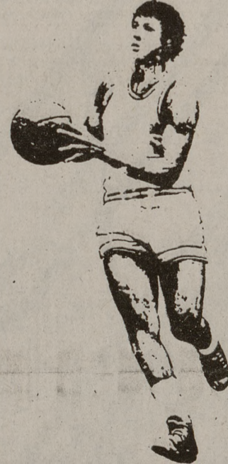
College Basketball Preview

Kentucky's new head coach, Eddie Sutton, has the task of trying to improve last year's 18-13 team under Joe B. Hall. In trying to do that, the Wildcats boast All-American