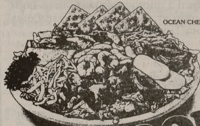
OCEAN CHEF SALAD