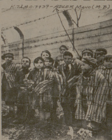
Berkowitz (third from right) and other inmates at Auschwitz

"They put us in freezing baths, smeared chemicals on our skin, but it was the needles we were most afraid of. After the first 150 injections I stopped counting."