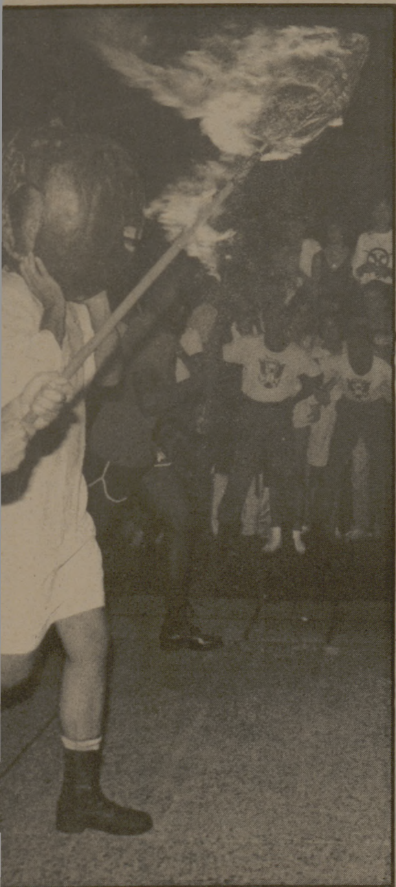
cadets traditional Great Pumpkin run.

O N-CAMPUS RESIDENTS dress up and go trick-or-treating in the dorms. Guys have special hours to visit the girls' dorms and girls have special hours to visit the guys' dorms. A costume contest and street dance are also held. In the past, people have given shots of alcohol to trick-or-treaters, but this year, due to the difficulty in identifying and carding minors, the RHA has asked that no alcohol be handed out. □