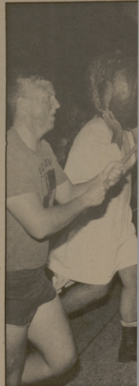
The Corp of Cadets traditi