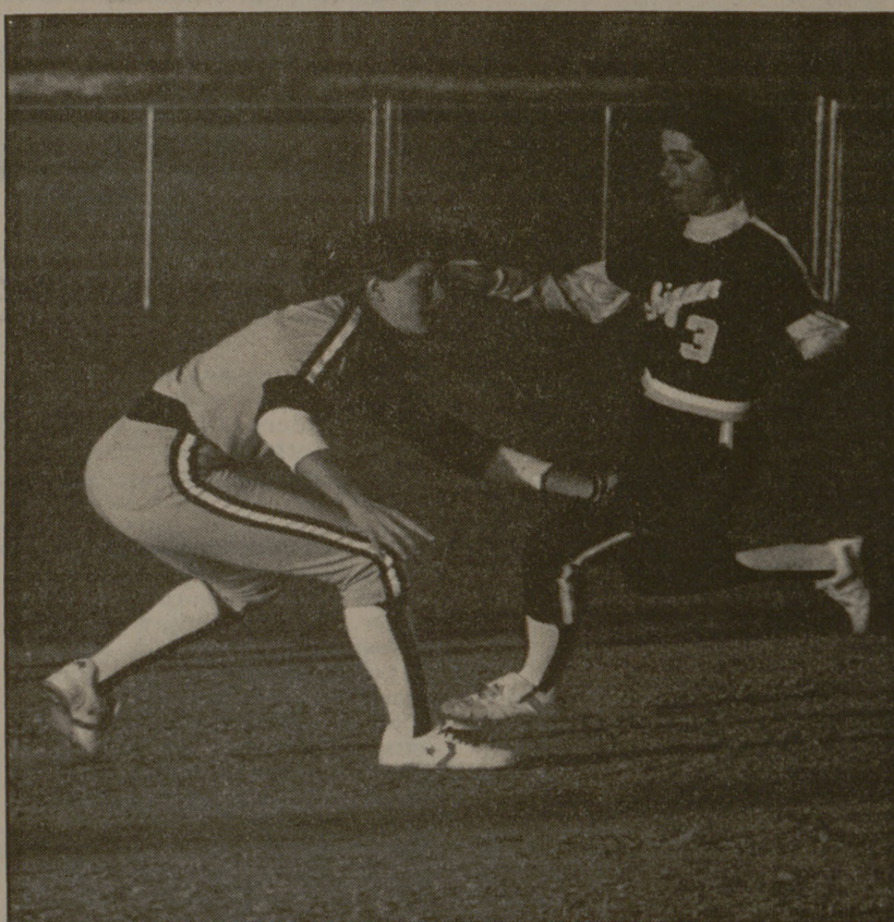
Battalion File Photo

1985 BMW 635 CSI Auto. Polaris-Pacific, 11,000 miles. $34,500. 774-0033. 17/10/8