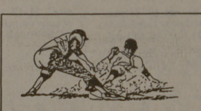
Other Sunday games:

Associated Press HOUSTON — Dave Concepcion smashed two hits and drove in three runs, including a game-winning ninth-inning RBI, to lift the Cincinnati Reds to a 6-5 victory over the Houston Astros Sunday night.