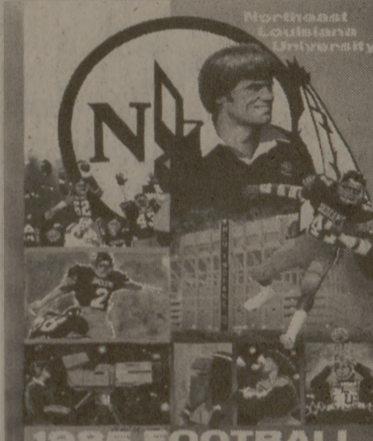
NLU's 1985 media guide

But I really like the headline for the profile on 6-foot-5 Will