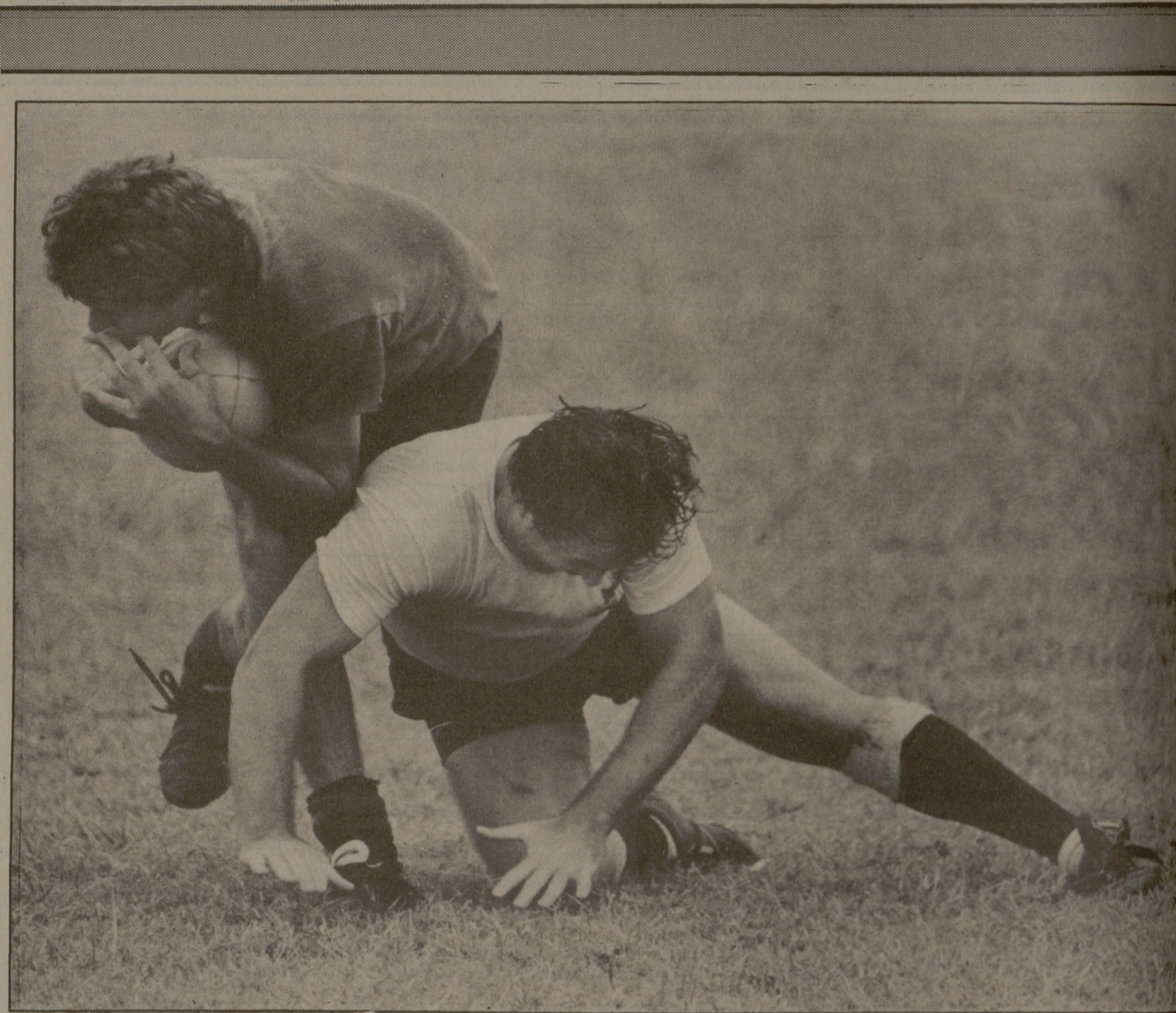
The Texas A&M Rugby Club, shown in action above during a tournament here this summer, begins its fall schedule Saturday.