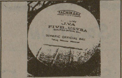
Volleyball Top 20 Poll