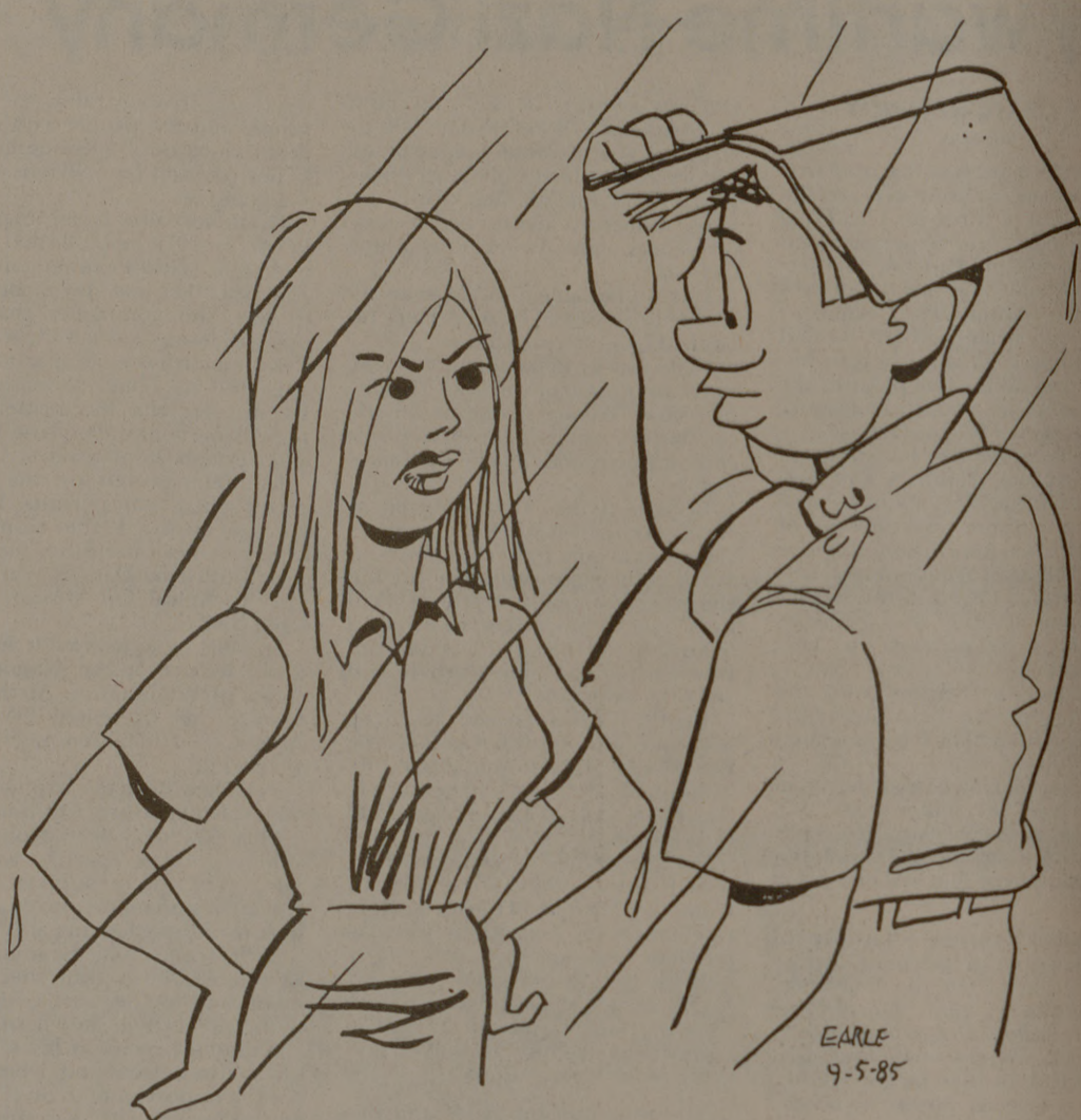
"All I had to do to break a three-month drought was to get my hair fixed."