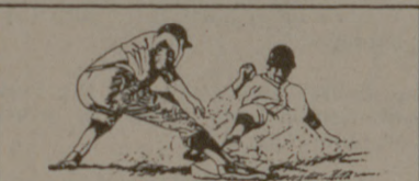
Other Wednesday scores: (Home team in capitals)