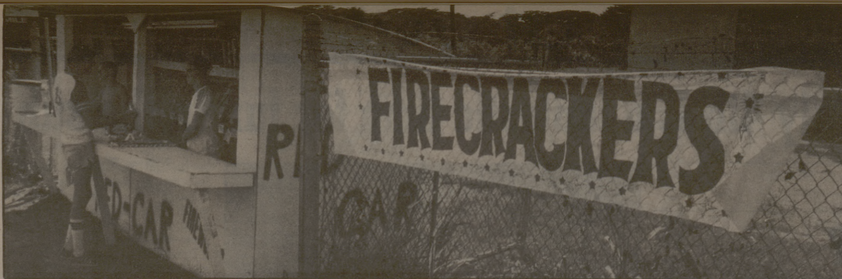
(pictured above) A customer buys fireworks from one of the many stands around this time of year. Though fireworks are legal outside city limits, it is illegal to sell them or set them off inside city limits. (to right) Fun with friends in the pool is one of many Fourth of July activities.