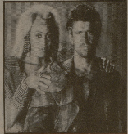
Pictured are (clockwise from top): Jack Nicholson, Kathleen Turner, director John Huston and Anjelica Huston in Prizzi's Honor ; Mel Gibson and Tina Turner in Mad Max Beyond Thunderdome ; and Pee Wee Herman in Pee Wee's Big Adventure .