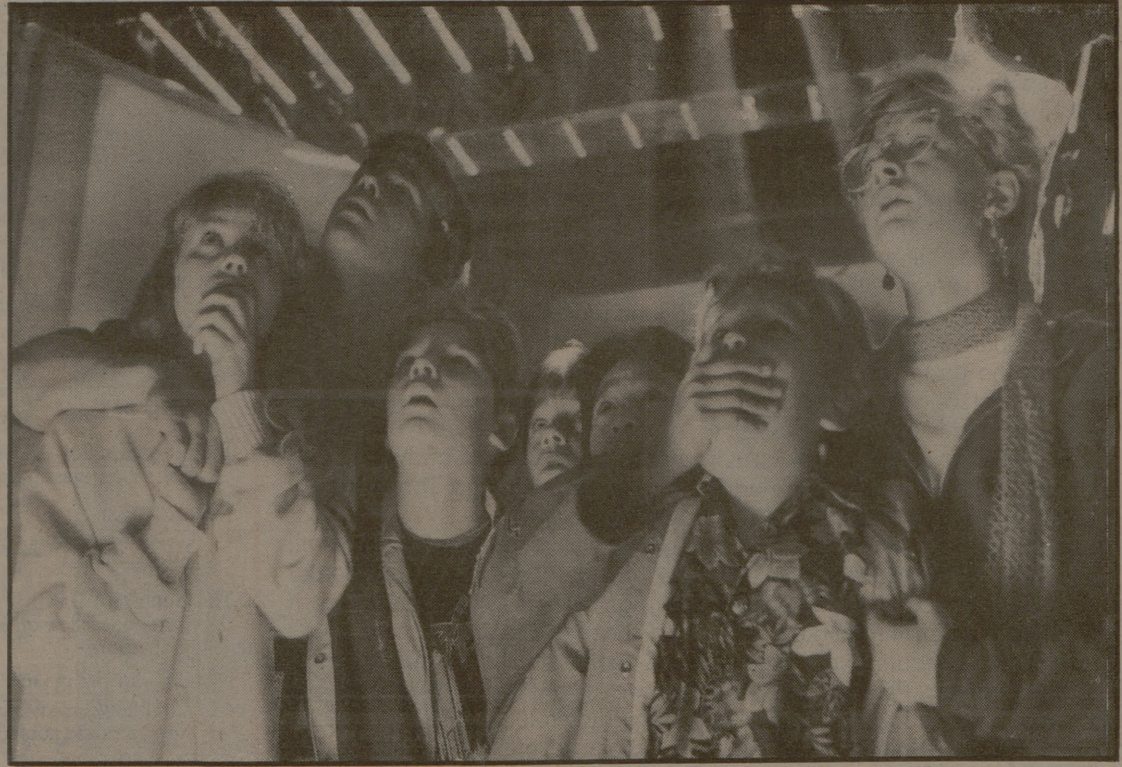
(left to right) Kerri Green, Josh Brolin, Corey Feldman, Sean Astin, Ke Huy-Quan, Jeff B. Cohen and Martha Plimpton star in Goonies . Steven Spielberg is executive producer of this sci-fi/adventure film.