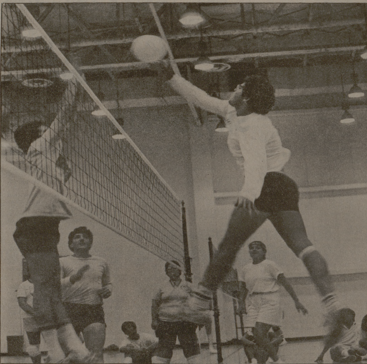
Volleyball triples (pictured above) is one of three team sports being offered this summer by the Texas A&M Intramural Office. Also available are basketball triples and slowpitch softball.

And would-be players should not be deterred by the hot summer