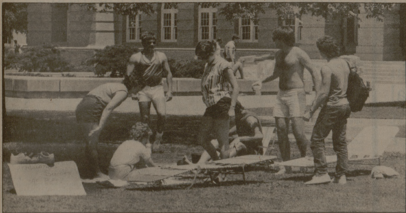
Flaunting their freedom from studies, these graduating seniors relax in front of the Academic Building.