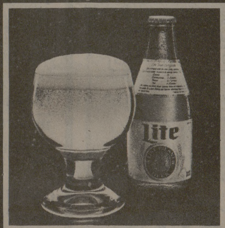
© 1985 Miller Brewing Co., Milwaukee, WI

EVERYTHING YOU ALWAYS WANTED IN A BEER. AND LESS.