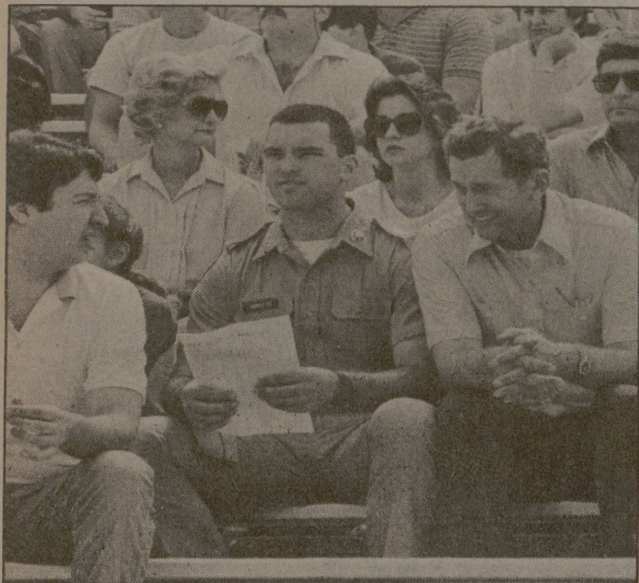
Parents and students spend time together while watching the intersquad football game.