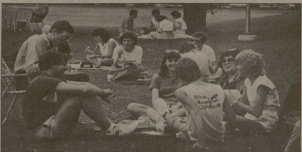
Residents of Clements Hall host a barbecue for their parents.