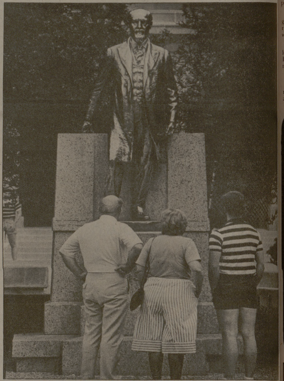
Parents visiting the campus inevitably stop to admire the Lawrence Sullivan Ross statue.