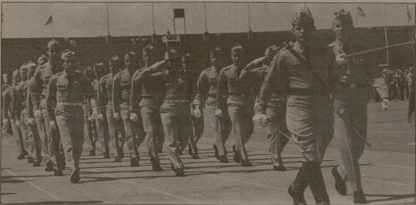
Company F-1 passes in review after the Corps of Cadets awards presentation at Kyle Field.