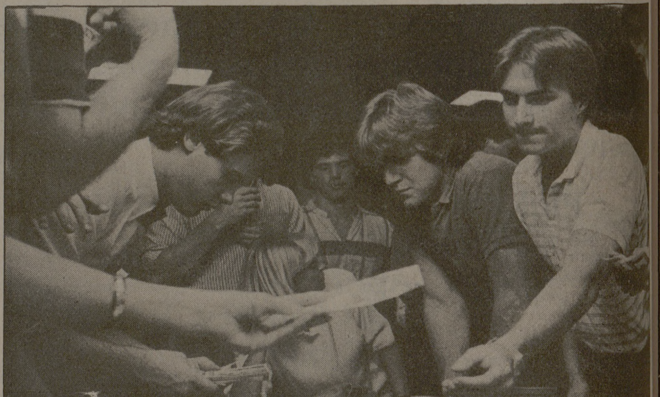
RHA Casino Night is a chance for parents and students to have a good time while raising money for the association.