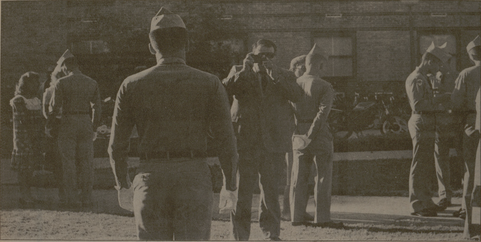
Proud parents use the weekend to fill the family photo album.