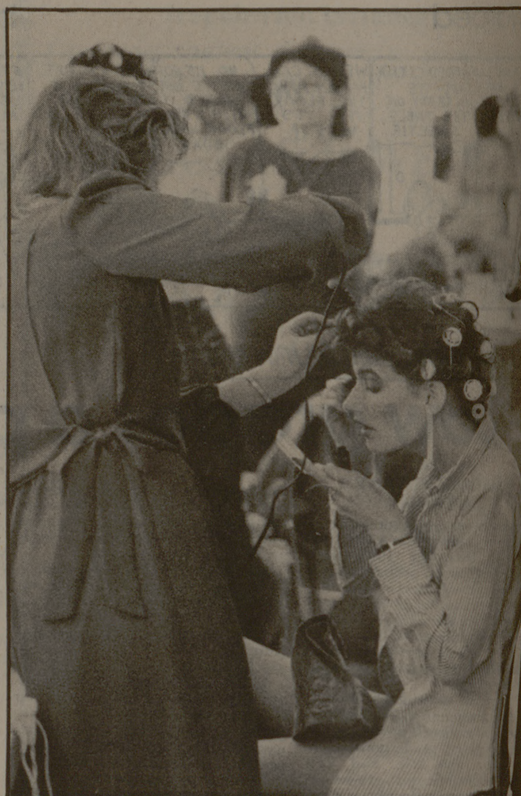
Rhinestones and hot rollers: Even Rome wasn't built in a day.