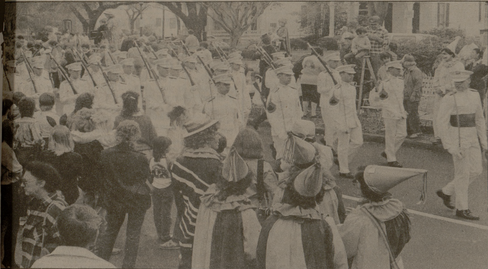
The Ross Volunteers march down St. Charles Street in New Orleans during the King Rex parade.