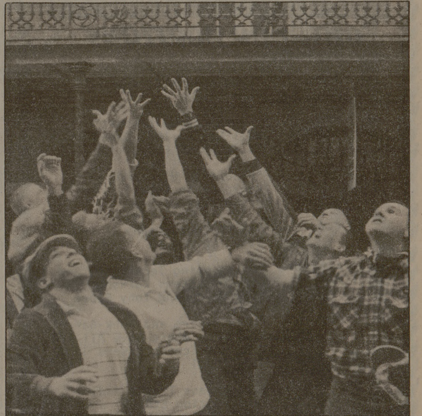
Ross Volunteers reach to catch coveted Mardi Gras beads being thrown from a balcony above.