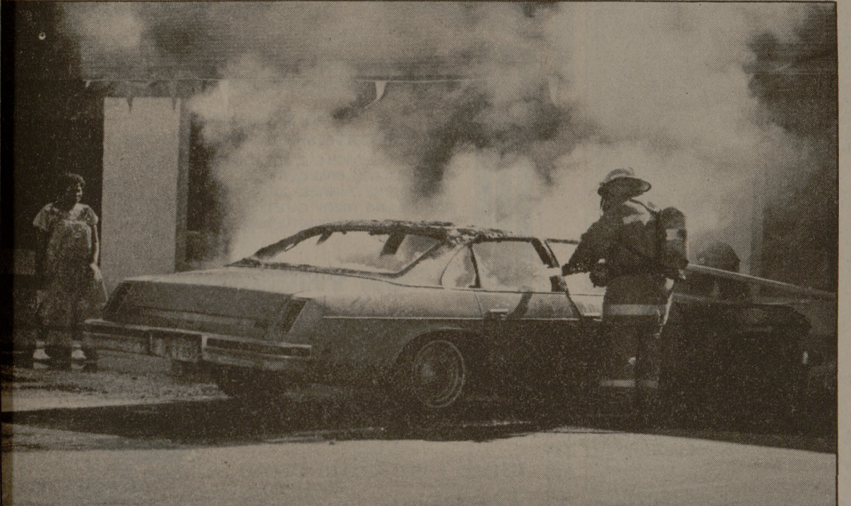
Just In Time