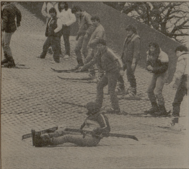
...but he still manages to wind up on the right end.