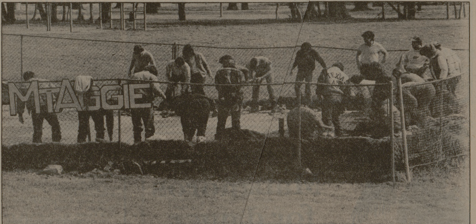
Courageous P.E. students prepare to tackle Mt. Aggie.