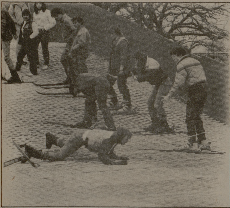
This novice skier wipes out himself and his instructor...

P.E. students learn to ski Texas style — without snow