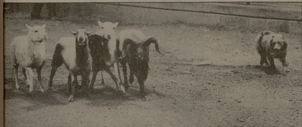
The sheep refuse to co-operate, so ...