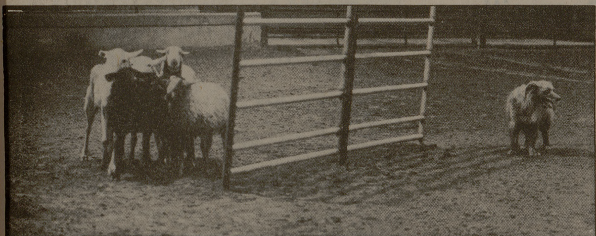
Bud awaits a command to herd the sheep.

Move over cowpokes and don't punch that doggie