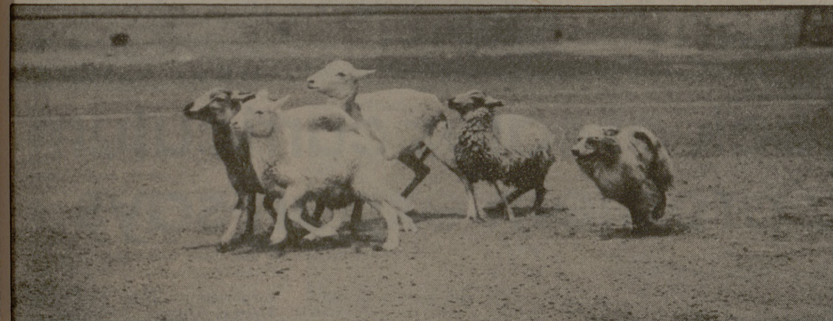
Bud decides to give them the runaround.