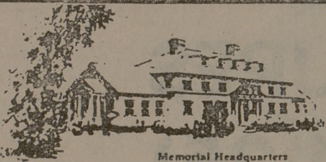
Memorial Headquarters Memphis, Tennessee

Class of '86 PRESENTS MASQUERADE BALL featuring the EXECUTIVES FEBRUARY 1, 1985 8-12 PM MSC BALLROOM TICKETS: MSC, COMMONS, SBISA SEMI-FORMAL