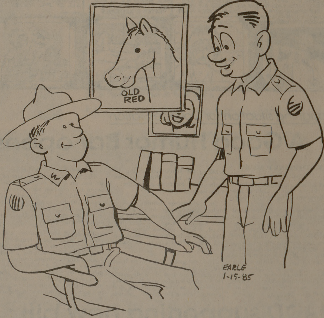
"It's outstanding that the Parsons' Cavalry is marching in the Inaugural Parade! However, I think they would like it better if you were toward the back instead of being in fourth place."