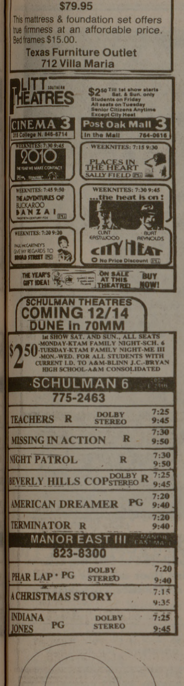
Monday, December 10, 1984/The Battalion/Page 11