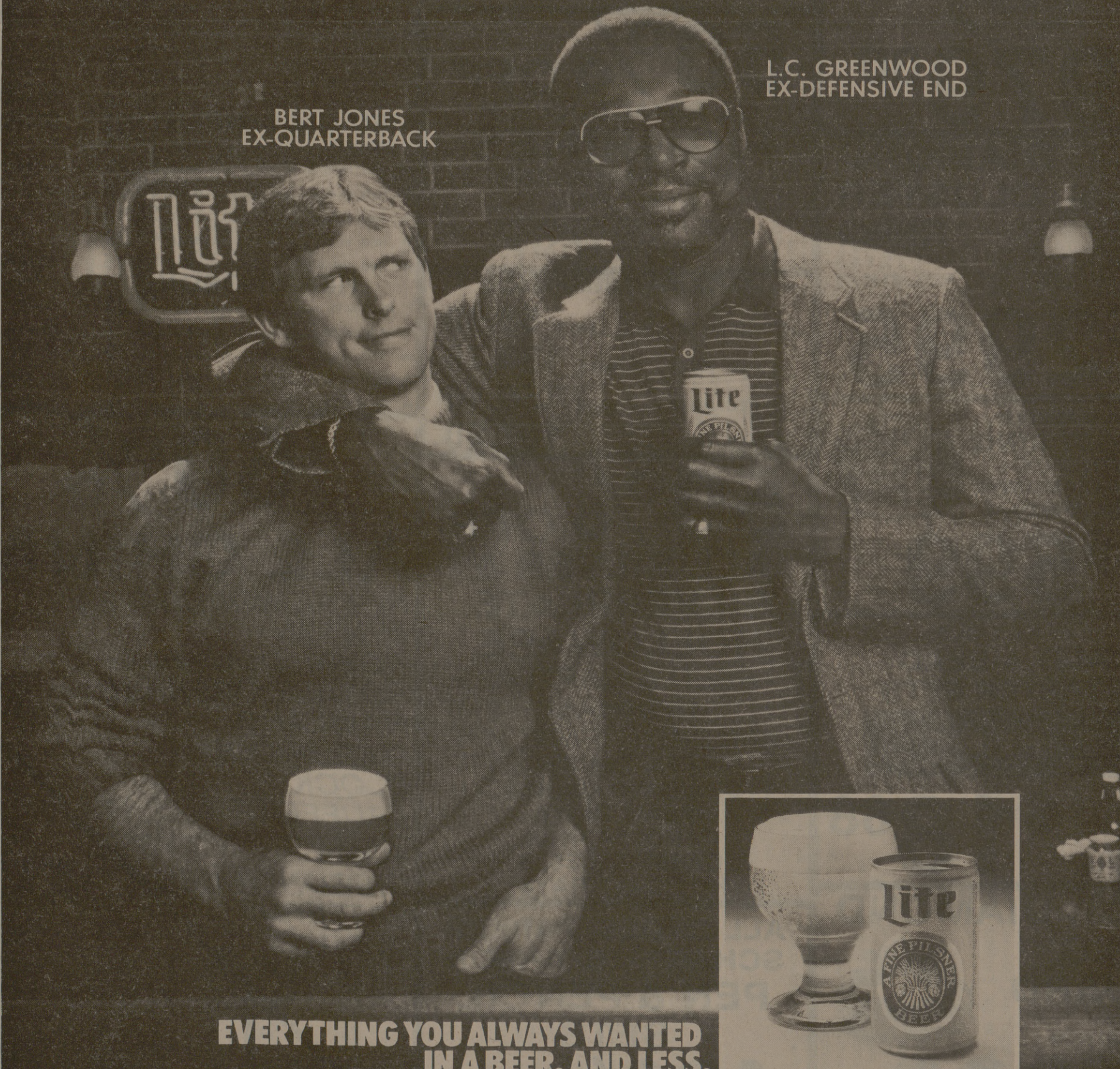
BERT JONES EX-QUARTERBACK

"LITE BEER IS A LOT LIKE QUARTERBACKS. I CAN'T WAIT TO GRAB HOLD OF ONE"