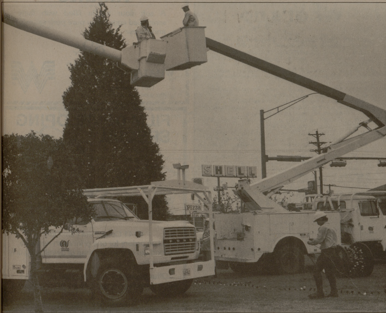
Stringing in the rain