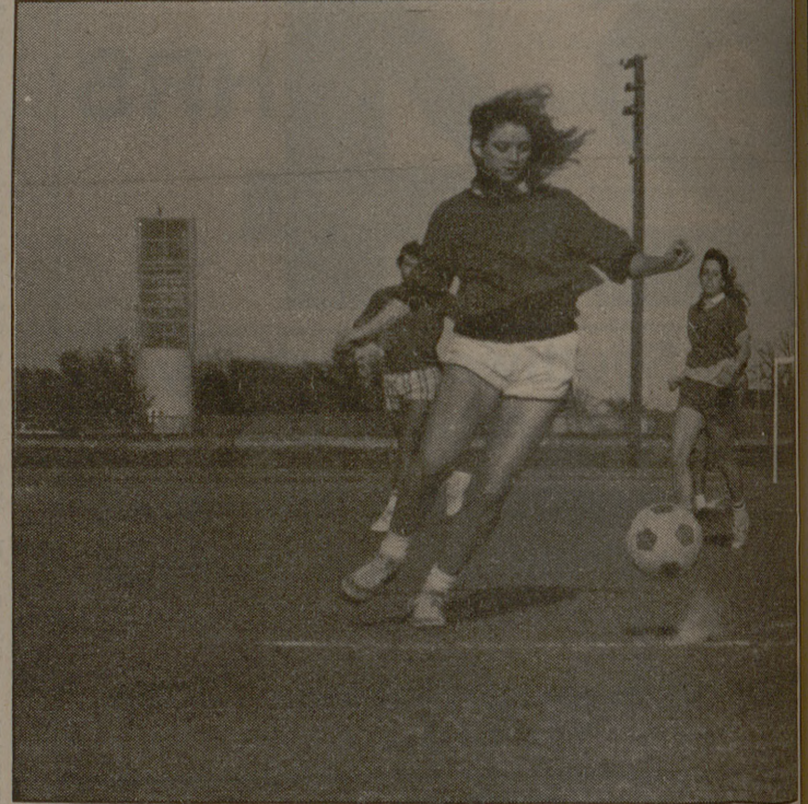
OUTDOOR SOCCER entries open today. Sign up in Rm 159, E. Kyle.