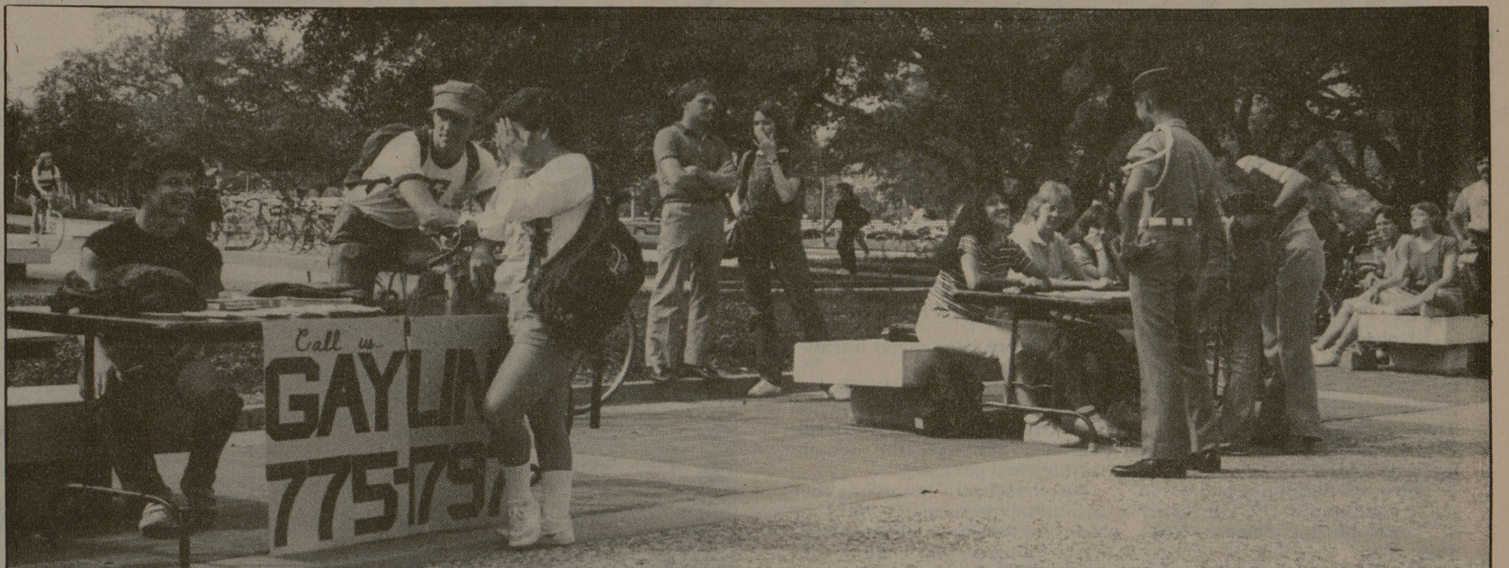
Difference of opinions

Ripley said the main concern is the safety of all the participants.