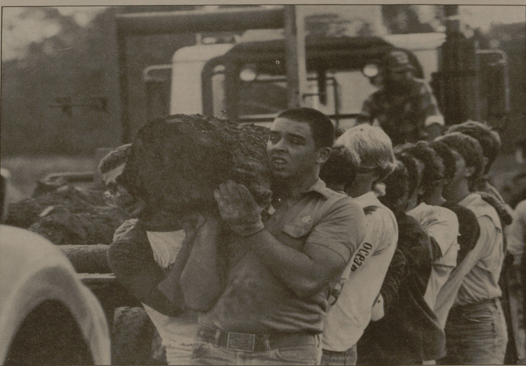
Log lifting Despite the rainy weather, bonfire spirit still runs high as members of Davis-Gary Hall and Squadrons 6 and 13 show.