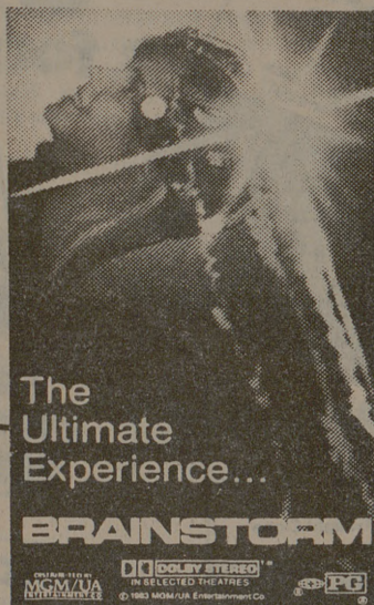
The Ultimate Experience... BRAINSTORM DOLBY DIGITAL MGM/UA © 1983 MCA/UA Entertainment Co.