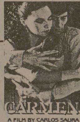
CARMEN A FILM BY CARLOS SAURA