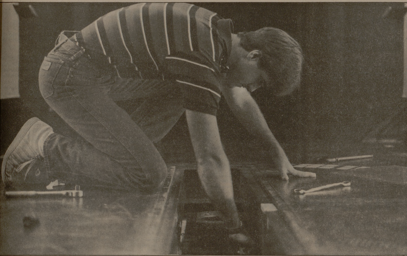
A calm in the wind