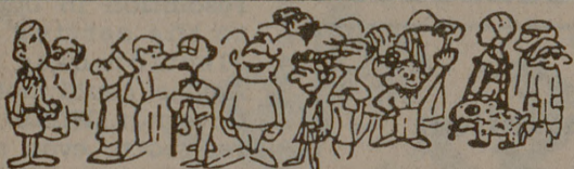
Day students get their news from the Batt.

The Meat Science and Technology Center is located on West Campus next to the Kleberg Center (phone:845-5651). Other beef, pork, lamb, sausage and dairy products are available. Prices effective through October 12, 1984. We are open for business Monday through Friday from 9:00 A.M. to 6:00 P.M.