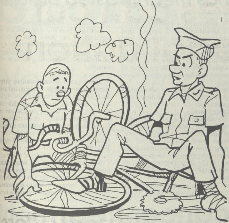
"With five thousand acres of campus, you couldn't keep from hitting me?"