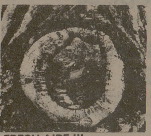
FRESH AIRE III