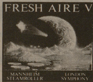
FRESH AIRE V