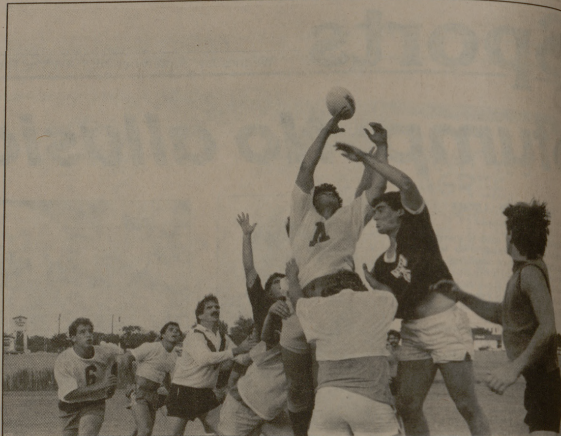
"I've Got It!" Members of the Texas A&M Rugby Football Club leap for control of a line-out during a practice last week. The team was practicing for last weekend's game against the Houston Heathens. The A&M's first side advanced their record to 2-0-1 beating the Heathens 28-6.